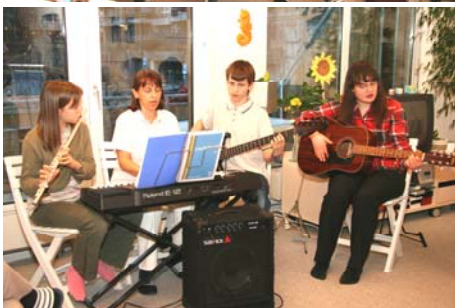
Bowling, the Suisse way...

The 2 photo's below show the meeting and band in Switzerland during the visit from a family from Holland and a sister from Germany