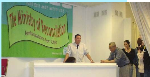
Baptism in Rotterdam

Look after what has been given you as only a few people have what we have.