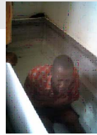
Baptism in Abidjan

At the end of the month we had three days of fasting and praying for the growth of the church. Matthew 17:21, Mark 9:29 . We ended the fast at the Thursday night meeting, where two people received the Holy Spirit and one was baptized. It was a great night, the brethren were all together