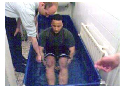
Baptism in Almere

It was a great month with prayer and fasting and a lot of talks. We have grown further, becoming more effective and efficient for the Lord!